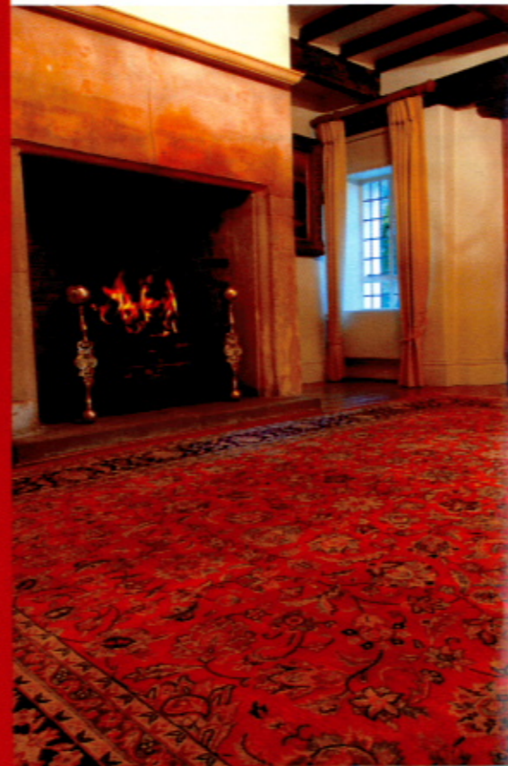
Fine Indo Persian. Exceptional quality and durability. Ref. IFF002

GH Frith have the largest stock of Hand Made rugs and carpets in the UK, with over 20,000 on display