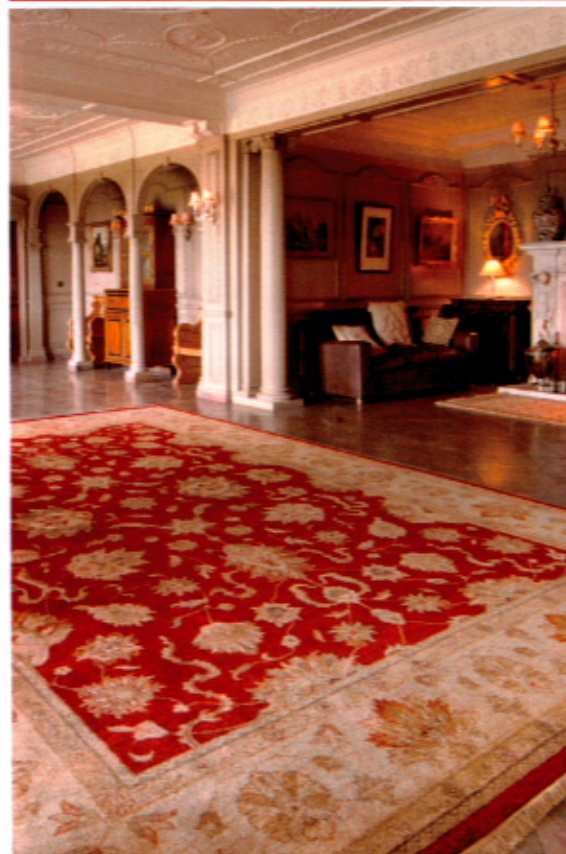
Quality Indian Ziegler rug made from 100% Argentine wool. Ref. LZV070

GH Frith have the largest stock of Hand Made rugs and carpets in the UK, with over 20,000 on display