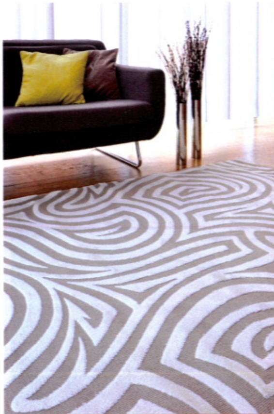
Stunning Designer Rugs. Make your room a work of art. Chinese Acrylic. Ref. NCY008