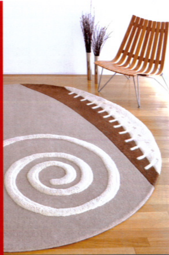
Funky modern designs. Textured rugs that look and feel fabulous. 100% wool. Ref. IJB201