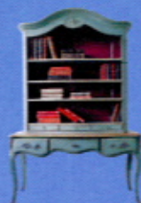
Six-drawer console bookcase, £4,340, Grange (020 7935 7000, grange-london.com)