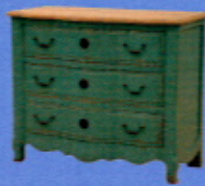
Chest of drawers, £372, Sweetpea & Willow (0845 257 2627, sweetpeaandwillow.com)