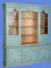
Glazed display cabinet, £1,215, Juliette's Interiors (01789 721911, juliettesinteriors.com)